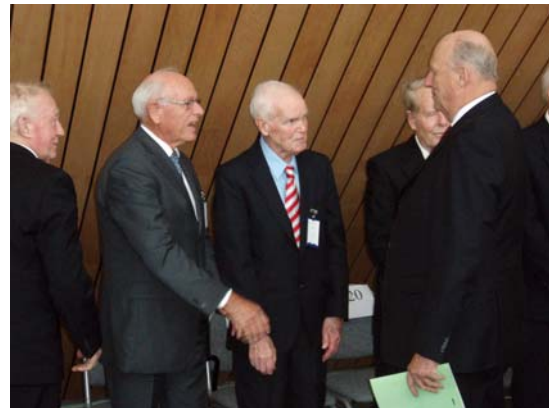
Alfred and the King